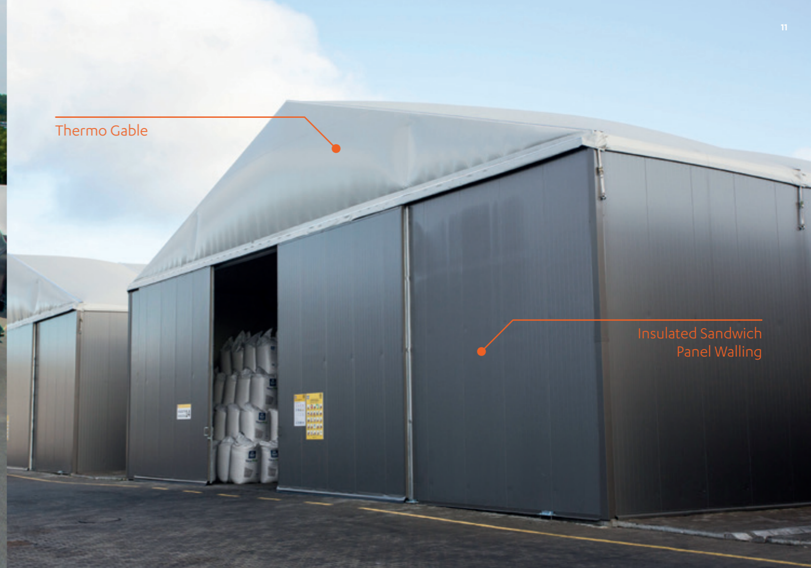
Insulated Sandwich Panel Walling