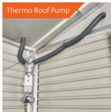
Thermo Roof Pump

The insulated wall panels are available in thicknesses of 40mm, 60mm, 80mm, 100mm & 120mm.