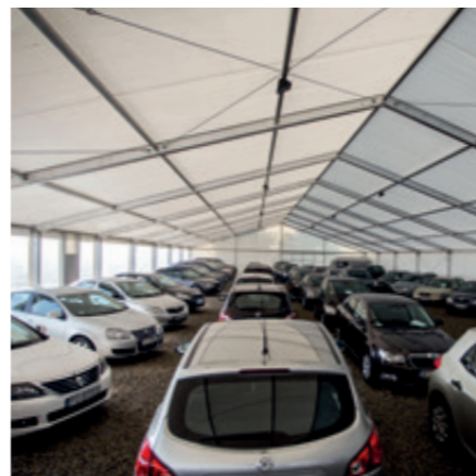
Single Skin PVC Roof & Walls

The roof is made from single skin PVC and the walls are either PVC or corrugated sheet steel for greater security. The main framework is made from aluminium with steel connecting joints.