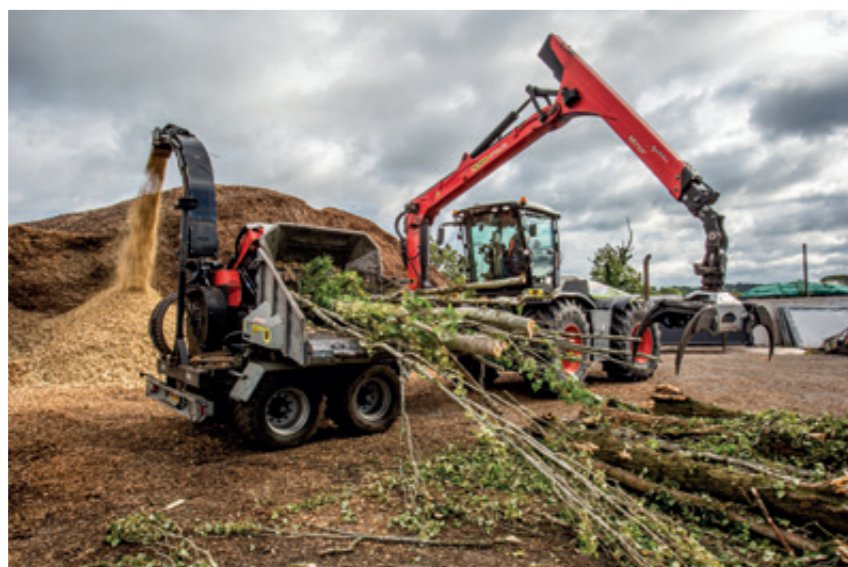
Chipping virgin wood

The fuel for the biomass boilers is provided by our wood chipping business.