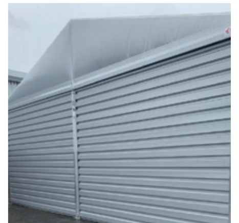
Thermo Roof with Single Skin Steel Walling

Standard single skin walls with an inflated twin skin thermo roof will eliminate condensation, giving your stock the required level of protection, especially if you are storing products packaged in paper or cardboard.